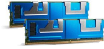
Figure 2. Intel® Optane™ Persistent Memory modules

databases using database access controls, ensuring end to end security of data. Deploying persistent memory in Exadata X9M is so simple, it's transparent.