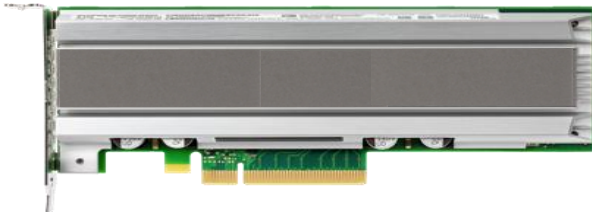
Figure 3. Flash Accelerator PCIe Card

These are real-world end-to-end performance figures measured running SQL workloads with standard 8K database I/O sizes inside a single rack Exadata system. Exadata's performance on real Oracle Database workloads is orders of magnitude faster than traditional storage array architectures, and is also much faster than current all-flash storage arrays, whose architecture bottlenecks flash throughput.